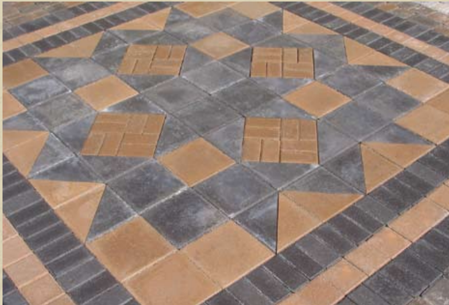
Arena Stone w/ Holland Stone: Charcoal & Desert Tan mixed on site