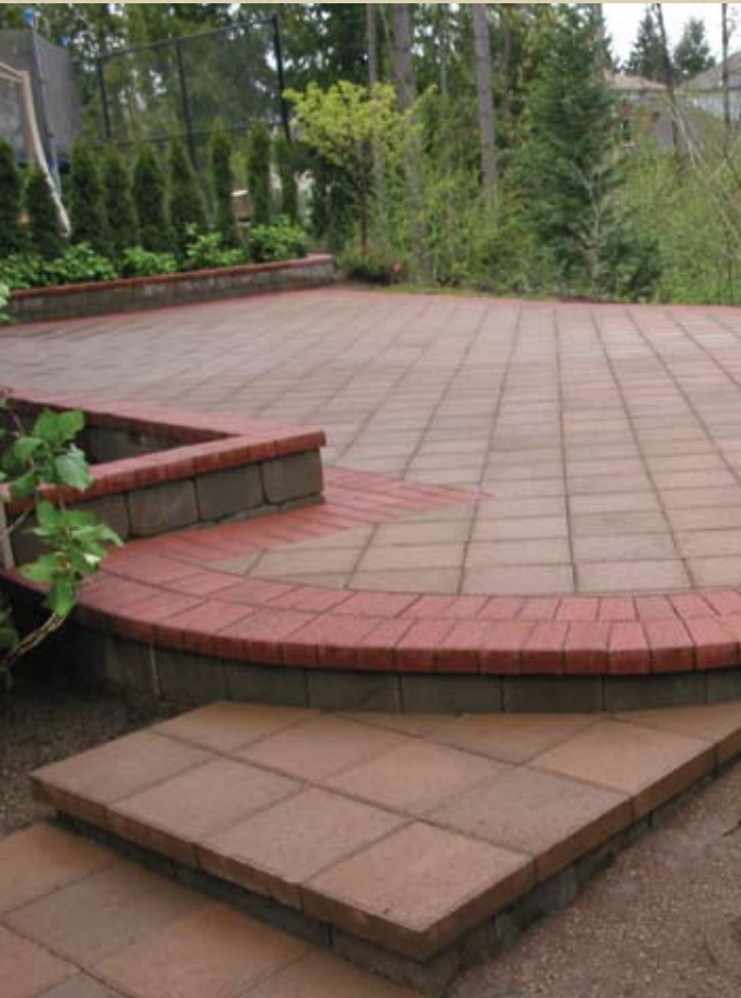
Arena Stone: Desert Tan

One of the larger stones in our collection is Arena Stone, a simple 12"x12" square. Its bigger size is perfect for large plazas. Arena Stone can also be used in conjunction with City Square or individually as stepping stones.