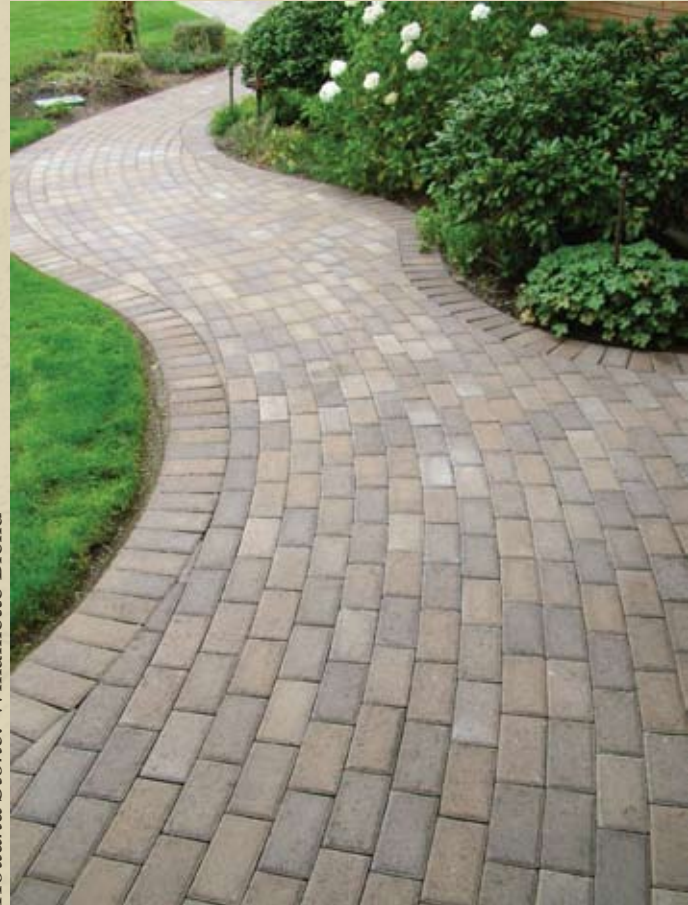
Holland Stone: Willamette Blend