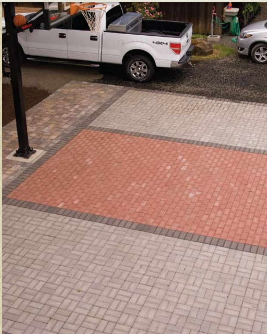
Holland Stone: Pewter and Western Red w/ Charcoal border