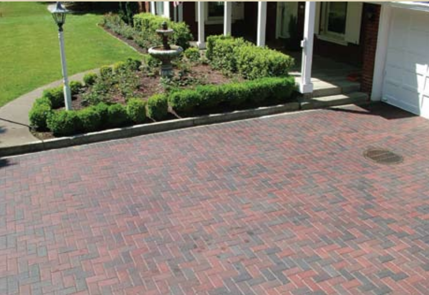
Holland Stone: Boston Blend