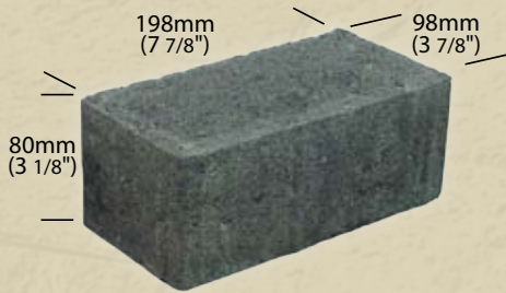
Also available in 80mm (non-stock)