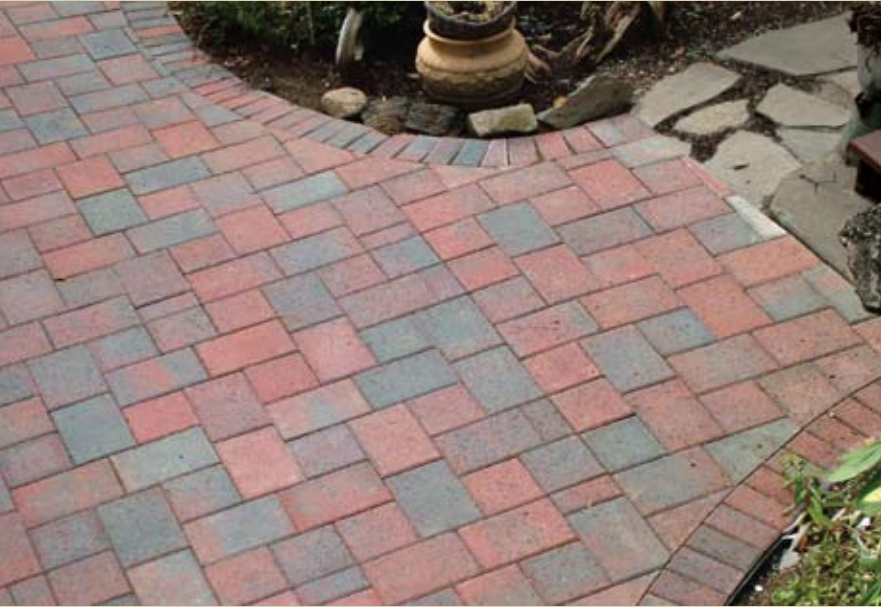
Park & Plaza Stone: Boston Blend