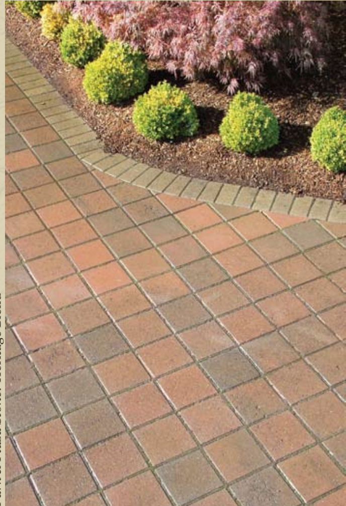
Park & Plaza Stone: Heritage Blend