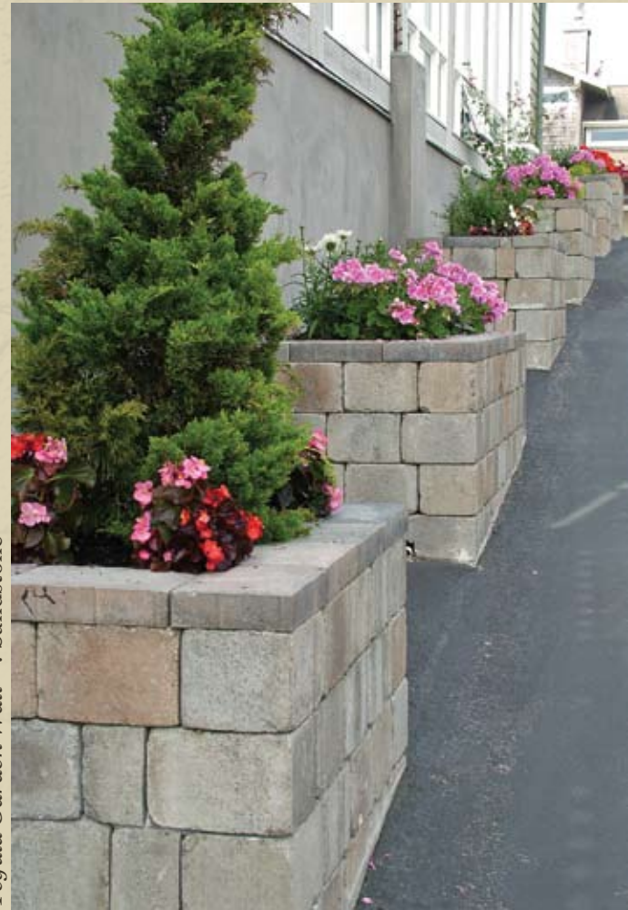
Tegula Garden Wall™: Sandstone