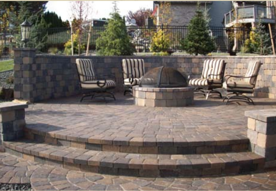
Tegula Garden Wall™: Charleston Blend