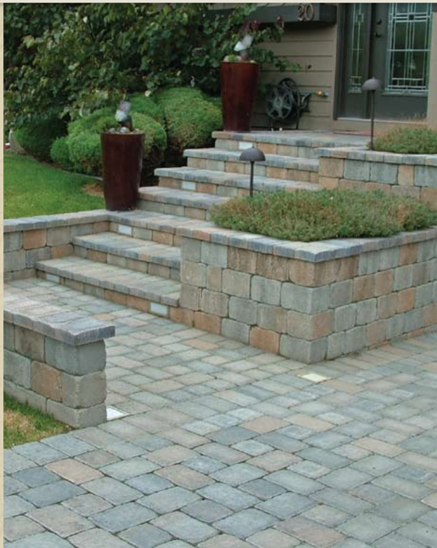
Tegula Garden Wall™: Sandstone Blend